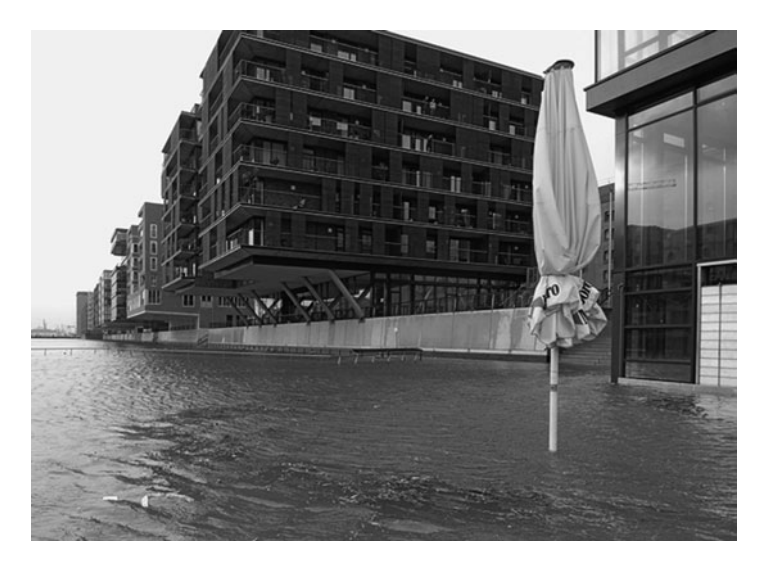
Figure 5. Basements of buildings during a storm surge in 2007.