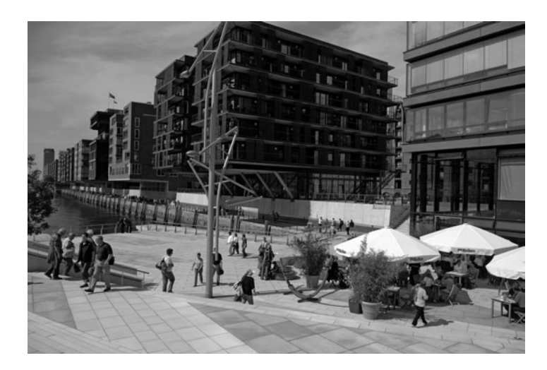
Figure 4. Basements of buildings, usual situation.

The disaster management arrangement is similar to that of Wilhelmsburg. The HafenCity also has storm surge information sheets to inform the residents about storm surge-related risks. Two streets are built higher to serve as evacuation roads in case of a high storm surge.